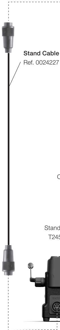
Stand Cable Ref. 0024227